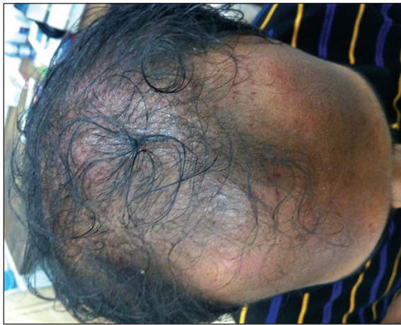
Figure 3: Pre-treatment clinical photograph

oral finasteride (FDA approved) either alone or in combination. [6,7] However, there are several reported side effects such as headache and increase in other body hairs for minoxidil [6] whereas loss of libido has been reported with oral finasteride. Finasteride also interferes with genital development in a male fetus and is contraindicated in pregnant women and those likely to become pregnant. [7,8]