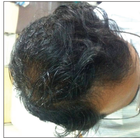
Figure 4: Post-treatment clinical photograph

Uebel et al. observed a significant improvement in hair density and stimulation of growth when follicular units were pre-treated with platelet plasma growth factors before their implantation. There was a significant